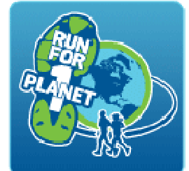
Pictured above: Banner by Tanya Zboya

blog.runforoneplanet.com/?m=200808&paged=2