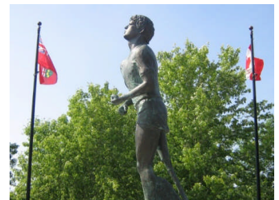
Pictured above: Terry Fox Monument, Thunder Bay, ON